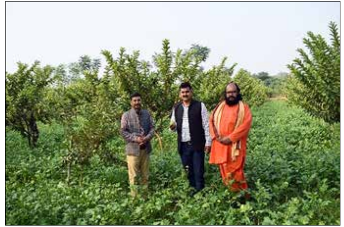
Table 2. Financial analysis of different agroforestry systems in India