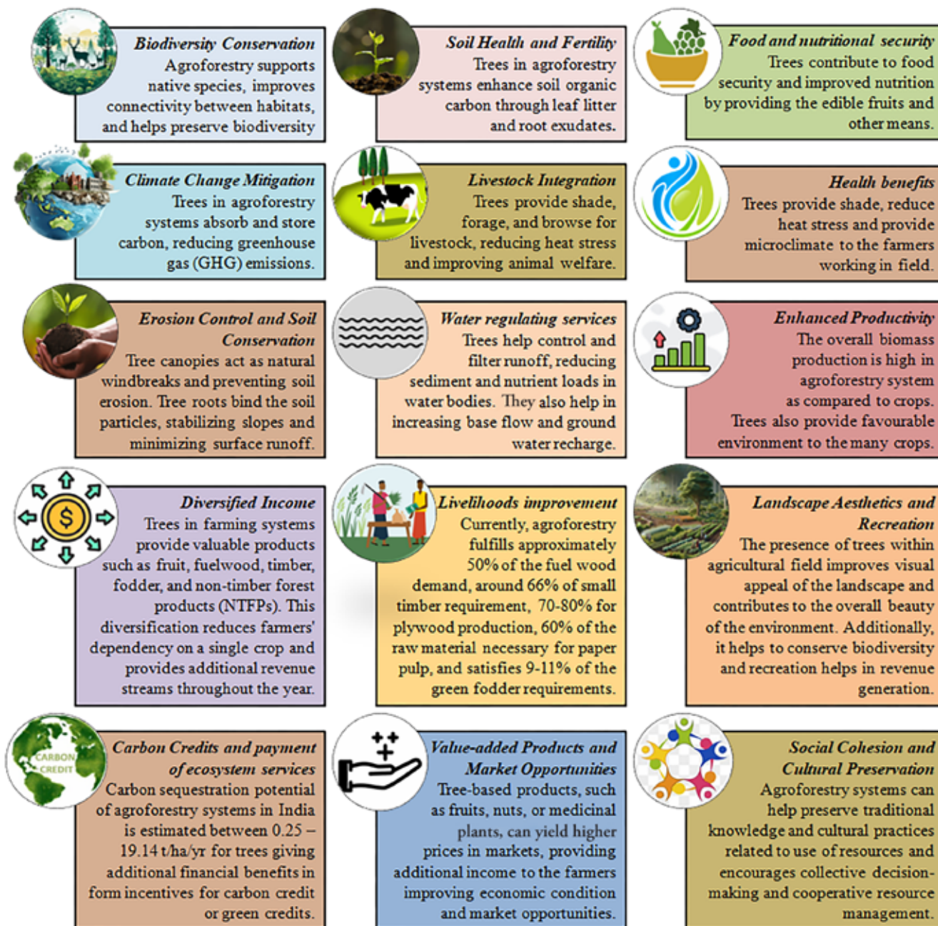
Multifaceted benefits form tree integration in the farming system

The different benefits of tree integration are described below.