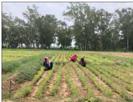
Manual weeding in pigeonpea

Chemical weed control plays a crucial role in modern agriculture, particularly in pulse crops, where rising labour costs and shortages limit manual weeding. Herbicides provide quick, efficient, and cost-effective weed management and also support conservation tillage systems. Herbicides are classified as selective or non-selective and are applied at different stages such as pre-plant, pre-emergence and post-emergence. Non-selective herbicides like glyphosate and paraquat are commonly used before sowing, especially in zero-till systems, while selective pre-emergence herbicides are applied within three days of sowing and post-emergence herbicides at 15–25 days after sowing. The effectiveness of herbicides depends on the compound, dose, timing, and method of application, and mixtures or sequential applications often improve control. However, excessive reliance on herbicides may cause weed flora shifts, resistance