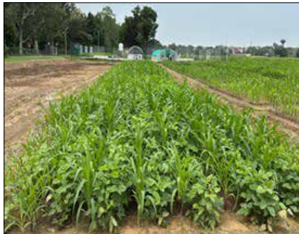
Intercropping mungbean with maize

labour-intensive, these methods are vital in smallholder systems. Techniques like the stale seedbed, soil solarisation and deep summer ploughing effectively suppress early flushes and perennial weeds, contributing to long-term weed management.