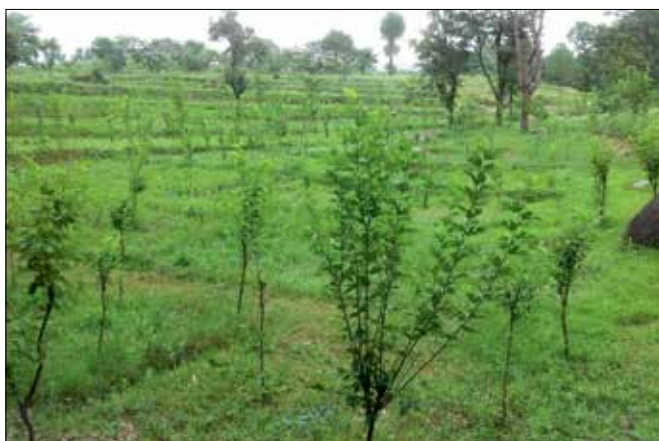
Mulberry based silvi-pastoral systems