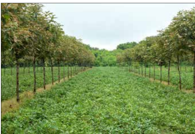
Teak based agri-silvicultural system

The ICAR-Central Agroforestry Research Institute (CAFRI) has developed region-specific models suited for different agro-ecological zones. Economic analysis shows that the benefit–cost (B:C) ratios of these models typically range from 1.3–2.5.