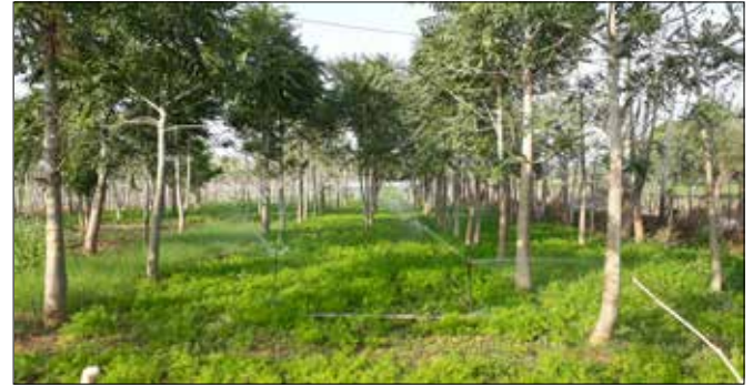
Ailanthus based agri-silvicultural

from peach-palm-based agroforestry were three times lower than high-input monocropping systems.