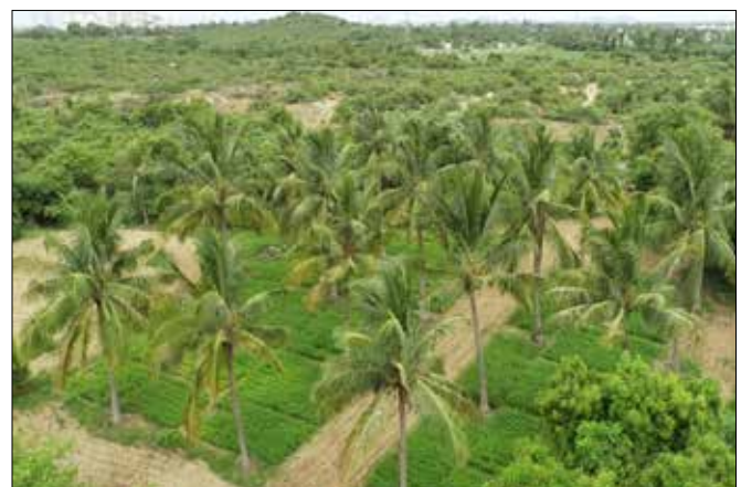
Coconut based horti-pastoral system