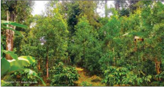
Litsea based agri-silvicultural system