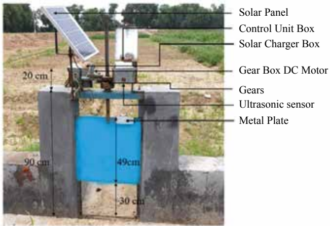
Automated surface irrigation system

The recent advances have facilitated the application of automation in both surface and groundwater irrigation which aid in achieving the target of maximum water use efficiency. Soil Moisture Sensor-Based Automatic Basin Irrigation System developed by Water Technology Centre, ICAR-IARI consists of three main units; a sensing unit, a communication unit, and a control unit. This system helps in water saving of 25% compared to the conventional manually controlled system in wheat.