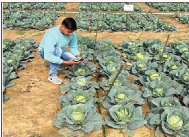
Drip irrigation in cabbage

At this critical stage, agriculture must embrace “water-smart” solutions that optimize how water is managed and applied. These approaches involve advanced technologies, resource-saving practices, and supportive policies that improve efficiency while safeguarding future supplies. We also need to focus on precision irrigation system which ensures the application of optimum amount of water to the plant at the right time and in the right manner. It also addresses the heterogeneity factor of land in terms of water stress through variable rate irrigation. With the advent of modern developments in information technology, machine learning, Geographic Position System (GPS), Geographic Information System (GIS), drone-based monitoring, and automation, the IoT enabled precision irrigation system has become more strengthened now.