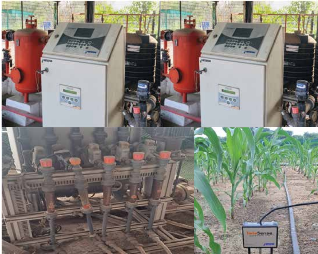
Automated irrigation system

Precision irrigation, data-driven decision-making, rainwater harvesting, conservation tillage, and drought-tolerant crops are just a few examples. Alongside technical measures, building community awareness, ensuring institutional support, and strengthening farmer training are also essential. Taken together, these strategies will help farming systems adapt to climate change, conserve resources, and maintain food security for future generations.