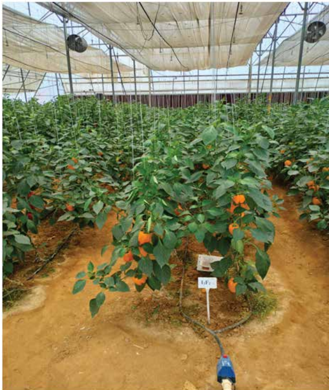
Precision irrigation system in protected cultivation