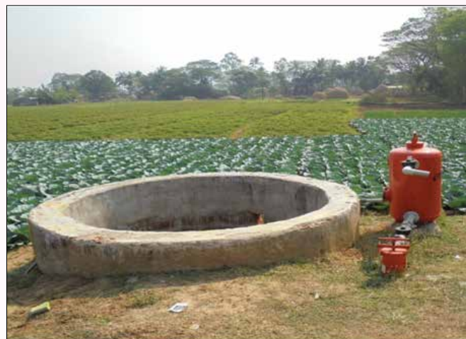
Drip fertigation system