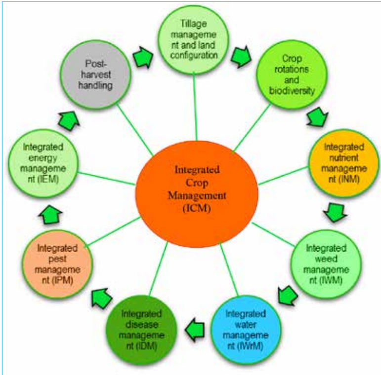
Major components of integrated crop management (ICM)

product supply, reduced dependence on non-renewable inputs, conservation of soil, water, and air quality, and the protection of biodiversity within agricultural landscapes. The approach is guided by five key principles, viz. Food security, Environmental security, Economic viability, Social acceptability, and Food safety and quality.