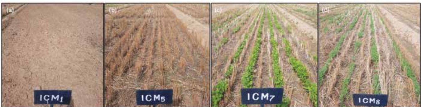
Integrated crop management trials under a fixed maize-wheat rotation included: (a) Conventionally tilled plots following wheat harvest, (b) Plots with wheat residues retained, (c) Incorporation of mungbean as an additional crop, and (d) Incorporation of sesbania green manure within wheat residue-retained plots.

Integrated weed management (IWM): IWM refers to keeping weed populations at levels low enough to avoid significant economic loss in crops. It is a strategy that combines all feasible, safe, and cost-effective measures whether ecological, economic, or toxicological to ensure weeds remain below the Economic Threshold Level