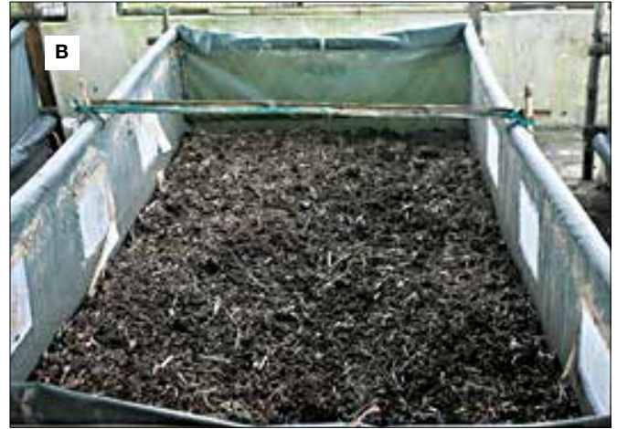
(A) FYM and (B) Vermicompost

(FYM), compost, vermicompost, poultry, and pig manures. While decomposing, it gives nutrients to crop plants, improves soil physical, chemical, and biological qualities, and increases soil plant nutrient availability by reacting organic acids generated by organic manures with soil nutrients comprising minerals. Besides being eco-friendly, it boosts soil microbial activity, which recycles nutrients. As mulch, it reduces soil moisture loss through evaporation. FYM, the decomposed mixture of farm animal excrement, urine, litter, and residual roughages or fodder provided to cattle, is the most frequent organic manure source to boost production and soil health. It contains a lot of plant nutrients that slowly feed agricultural plants. Unlike FYM, vermicompost is earthworm casts rich in macro and micronutrients, enzymes, and growth regulators. It is ideal for growing free-living and symbiotic bacteria that indirectly boost plant development and productivity.