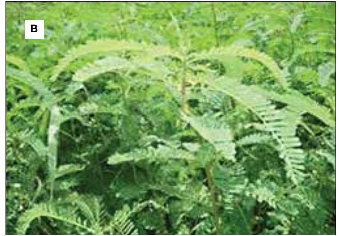
(A) Mulching and (B) Green manure crop ( Crotalaria juncea )

zinc, molybdenum, and nickel in ancient agriculture. Micronutrients are deemed vital trace elements because their requirement is modest. Despite their minimal demand, plants cannot complete their life cycle without these micronutrients. Farmers often overlook nutrient supplementation in modern agricultural production systems. The northeastern region's strong rains and acidic soil exacerbate crop nutrient deficiencies. To maximize productivity sustainably, soil health management is crucial. Crop rotation, intercropping, green manuring, green leaf manuring, organic manure, lime treatment, etc. assist maintain soil health. Soil testing is one of the most significant tools for recommending and applying the proper quantity of customized fertilizers, organic manure, and micronutrients to crop plants.