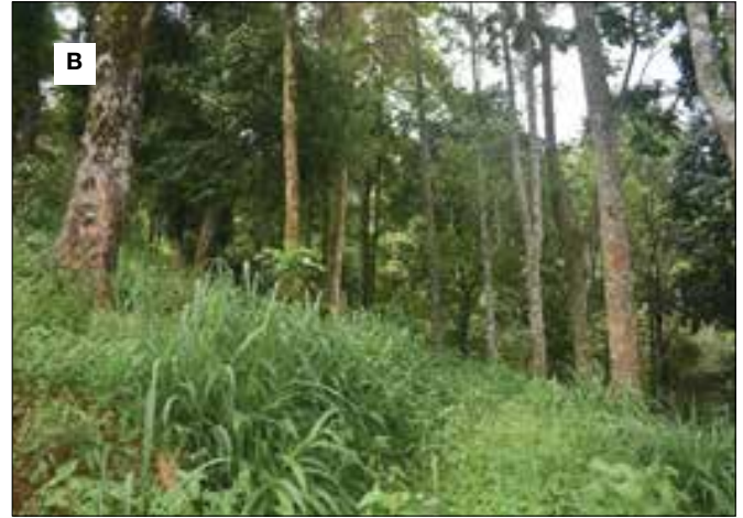
(A) Furrow liming and (B) Agroforestry system

individual field, is the focus of attention in this approach for development of INM practices for various categories. Nutrient conservation and application, technological advancements that make nutrients more available to plants, and information sharing between researchers and farmers are the pillars upon which it rests. INM has several benefits, including making more applied and in-soil nutrients available, ensuring balanced crop nutrition, improving soil physical, chemical, and biological properties, and reducing soil and water erosion by increasing soil organic carbon and decreasing nutrient losses.