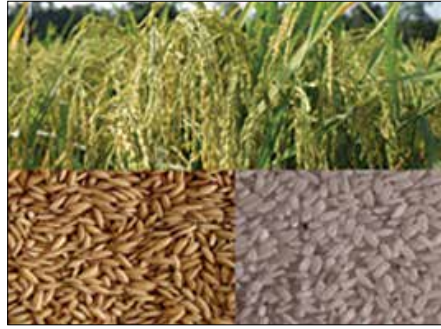
ICAR-NEH NICRA Hill Rice