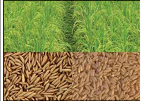
ICAR NEH NICRA-Boro Dhan 1

a cross between IRRI 132 and IR 74371-54-1-1. The plant matures in 100–105 days under transplanting and 92–94 days under direct seeding with a yield of 5.7 t/ha in kharif and 6.8 t/ha in boro season. The height of plants is 124 cm with dark green foliage, compact panicles and long, slender white grains.