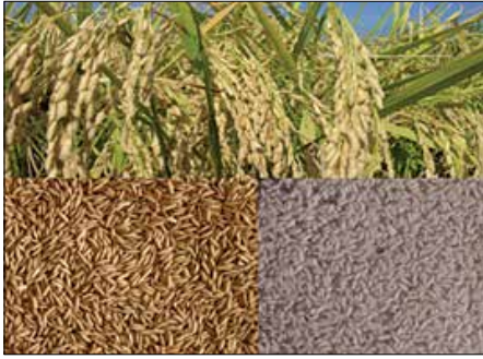
ICAR NEH NICRA Aerobic Dhan-2