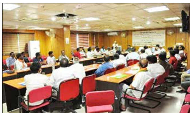
Training Programme conducted on “Weed Management in Field Crops” among the adopted farmers under FFP and distribution of seeds of Hybrid rice ( Ganga Hybrid ) to the farmers