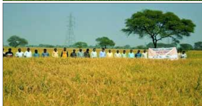
Popularization of Arize Gold 6444 and Ganga hybrid rice among the farmers of adopted villages under FFP