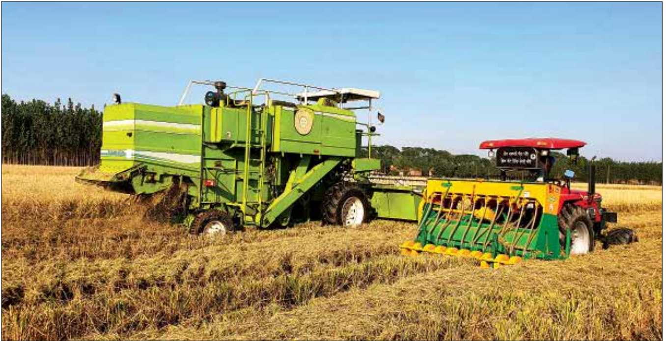
Combo technology of super SMS fitted combine and sowing of wheat with Happy Seeder

compared to 2023. In Punjab, a consistent downward trend has been observed, with reductions of 14% in 2021, 40% in 2022, 56% in 2023, and 87% in 2024 relative to the 2020 burning events (83,002 events). The impact of these initiatives is further illustrated by the adoption of in situ residue management practices in Punjab, which resulted in cost savings of ₹ 538 crores by lowering cultivation expenses, conserving farm nutrients valued at ₹ 495 crores through residue retention, and saving at least one irrigation cycle, thereby preventing the extraction of 571 million cubic meters (MCM) of groundwater. Most significantly, over the past seven years, more than 1,350 villages have been supported by ICAR-KVKs, with over 350 villages successfully transformed into “Burning Free Villages.”