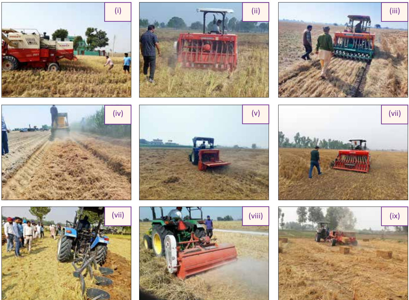
Farm machinery involved in paddy residue maangement; (i) PAU Super SMS attached combine harvester; (ii) Happy Seeder; (iii) PAU Smart Seeder; (iv) Paddy Straw Bale Shredder-cum-Mulcher; (v) PAU Surface Seeder; (vi) Super Seeder; (vii) Mouldboard plough; (viii) Paddy straw chopper; (ix) Baler

Straw baler: The straw baler collects loose paddy straw and compresses it into rectangular or round bales for easy handling. Before baling, standing stubbles are reaped with stubble shaver to facilitate smooth baler