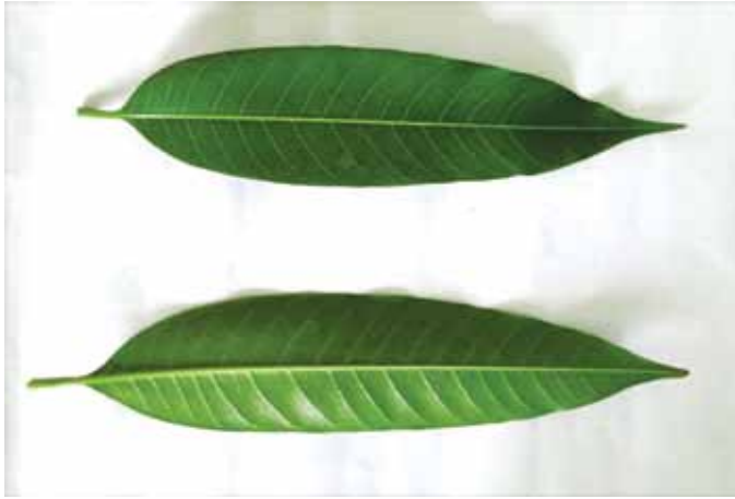
Leaves of Jammu Mango tree