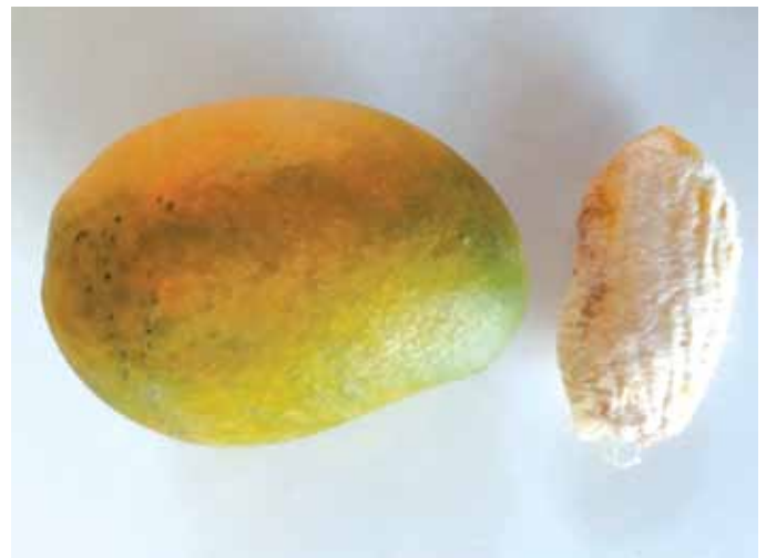
Ripe fruit, pulp and stone