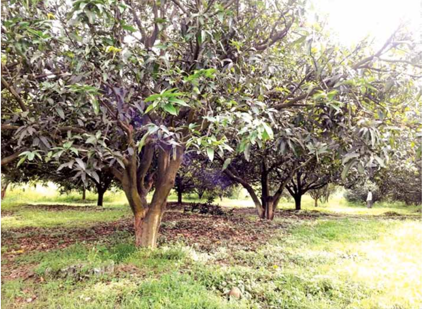
Mature tree of Jammu Mango Variety (Selection-05)