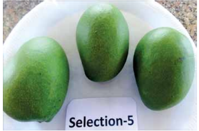
Unripe fruits of Jammu Mango