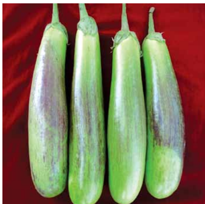
Fruits of Bidhan Supreme

transplanting. Two foliar sprays of 0.5% ZnSO 4 and single spray of 0.15% CuSO 4 during flowering increase yield and quality of fruits.