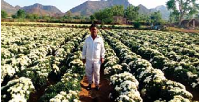
Sole crop of chrysanthemum