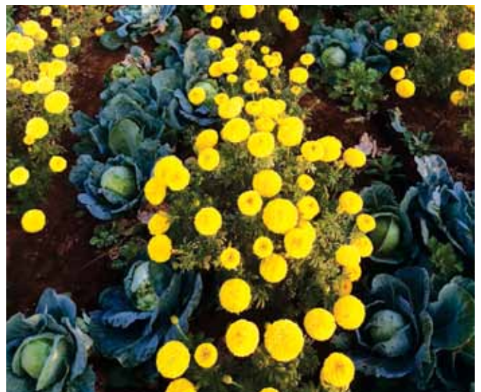
Marigold intercrop with cabbage