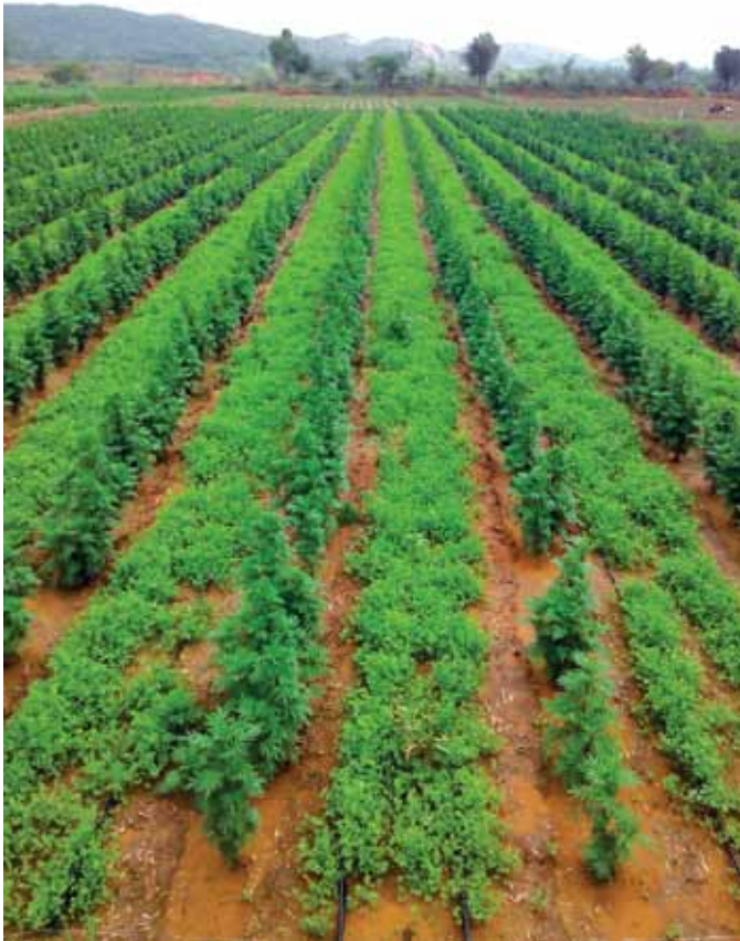
Marigold intercrop with coriander