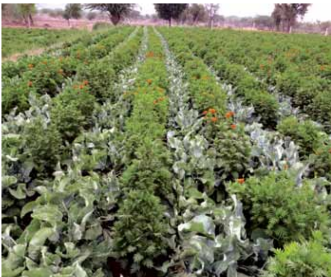
Marigold intercrop with cauliflower