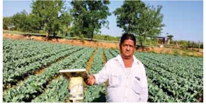
Sole crop of Cauliflower (with solar light insect trap)