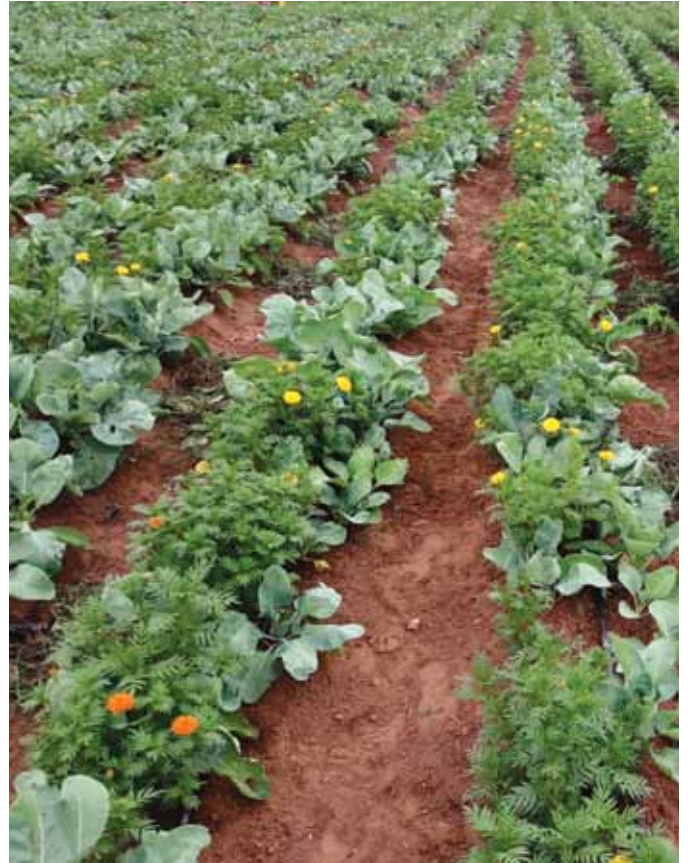
Marigold intercrop with cauliflower