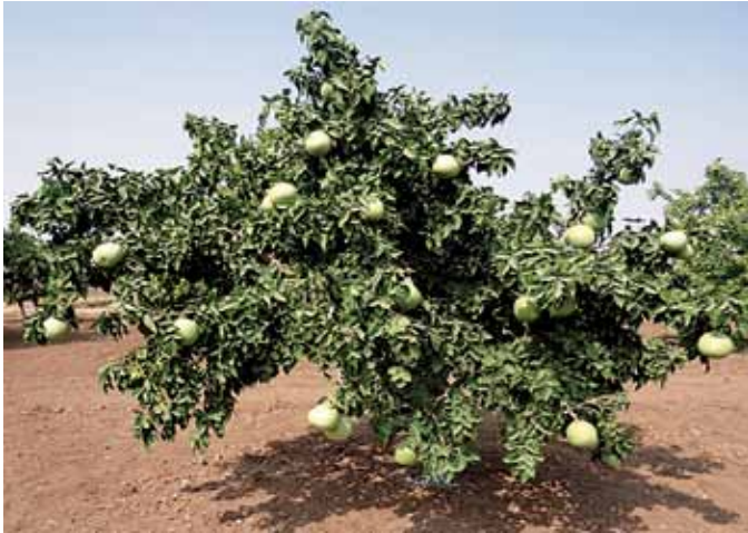
Eight year old tree: Goma Yashi