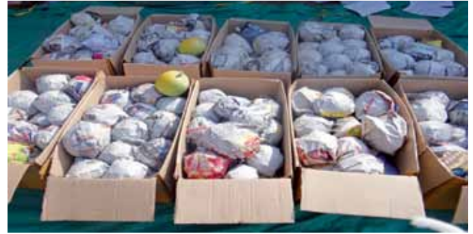
Packaging of fruit for marketing

plant growth and yield of quality fruits. Application of organic mulch over long period improved soil properties like pH, electrical conductivity, porosity and soil moisture holding capacity. Leaf litter of bael was also found effective to retain soil moisture and also improved the soil quality of the orchard.