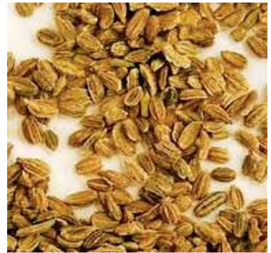
Umbel initiation and seed formation in carrot

Pusa Rudhira: Developed by ICAR-IARI, New Delhi. A tropical variety of carrot and roots take about 85-90 days for maturity after sowing. Roots have dark red colour with self core, 27 cm long and 3.4 cm diameter. Its leaves colour is dark and green. Plant height is about 65 cm with late bolting. Average root yield is 230 q/ha which is 50% higher yield over national check Pusa Kesar. Suitable for growing in NCR region.