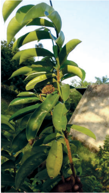
At fruit setting stage