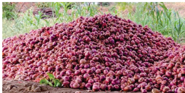
Harvested onion bulbs

it is essential to keep the crop weed free, especially 30-45 days from transplanting. Crop weed competition is recorded higher from transplanting till almost 45 days, it may reduce yield up to 60%. Application of weedicide oxyfluorfen 23.5% EC @ 1.5 ml/l of water before transplanting or 8-10 days after transplanting using flat nozzle sprayers followed by one hand weeding at 30 days after transplanting efficiently controls weeds in onion.