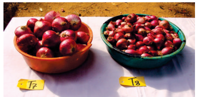
Weed management practices affects onion bulb size (T 7 with weed management; T 8 , control).