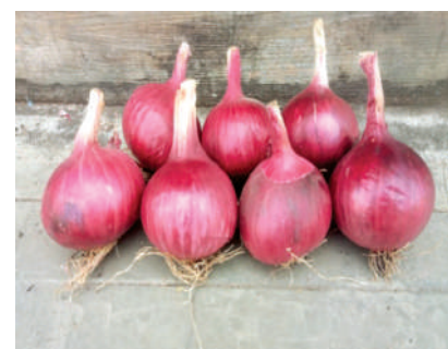
Bhima Dark Red

Bhima Shubhra: The variety was developed by ICAR-DOGR, Rajgurunagar, Pune, Maharashtra, is recommended for kharif season for Chhattisgarh, Gujarat, Karnataka, Madhya Pradesh, Maharashtra, Odisha, Rajasthan and Tamil Nadu. It can be also cultivated during late kharif season.