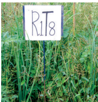
Oxyfluorfen 23.5% EC at 1-1.5 ml/l of water at transplanting + 1 hand weeding at 30 DAT