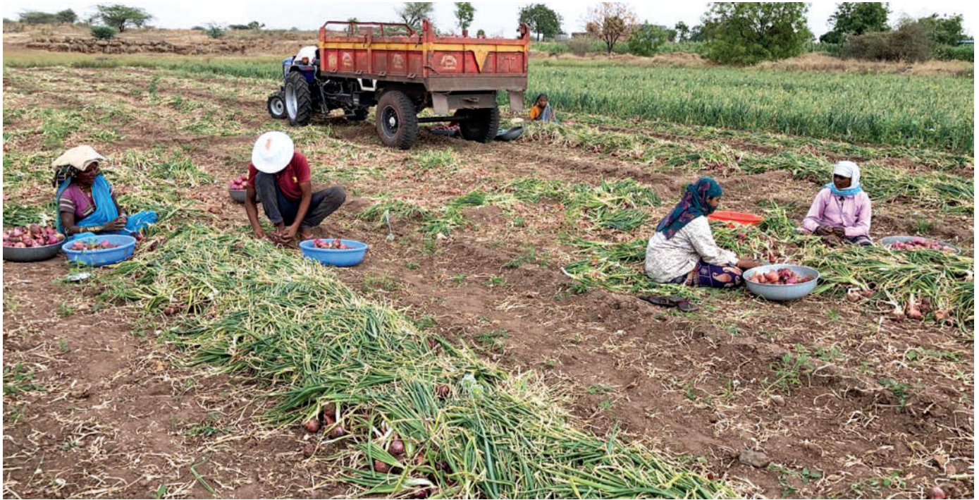
Onion harvesting and cutting