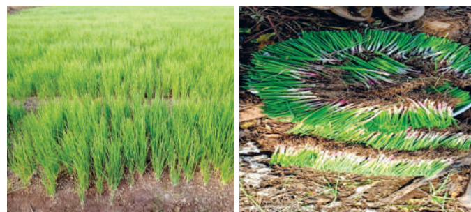
Onion seedling ready for transplanting