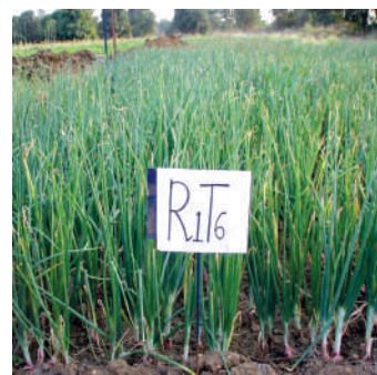
Control (without weed management practices)