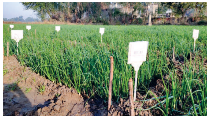
Oxyfluorfen 23.5% EC @ 1 ml/l of water with quizalofop ethyl 5% EC @ 1 ml/l of water @ 25 DAT +1 hand weeding at 45 DAT.

Ideal nutrient requirement depends upon soil type, available nutrient status of the soil and removal of nutrients by crop, etc. A nutrient management practice differs as per soil nutrient availability status. For normal