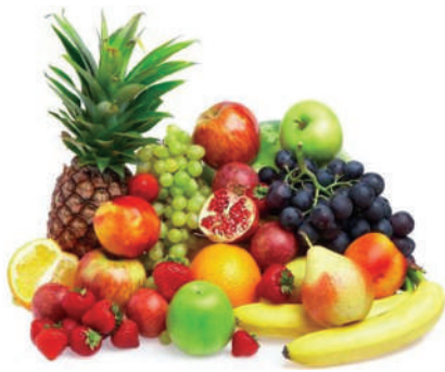
Fig. 2. High value fruits for dietary purpose