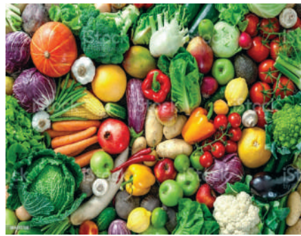
Fig. 3. High value vegetables for dietary purpose