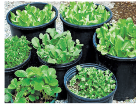
Fig. 4. High value green leafy vegetables for dietary purpose

diet. It recommends sourcing of macronutrients and micronutrients from minimum of eight food groups per day with vegetables, fruits, green leafy vegetables (Fig. 4), tubers forming essentially half the plate of the recommended foods per day. The other major portion consists of cereals and millets, followed by pulses and milk/curd. Vegetables/tubers (excluding potato) intake should be 350 g, while ideal consumption of fruit and nuts should be 150 g and 20 g per day, respectively.