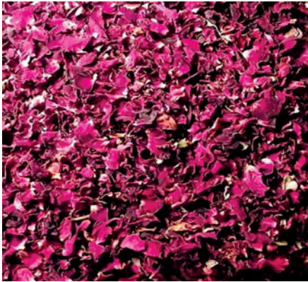
Air dried loose red rose petals