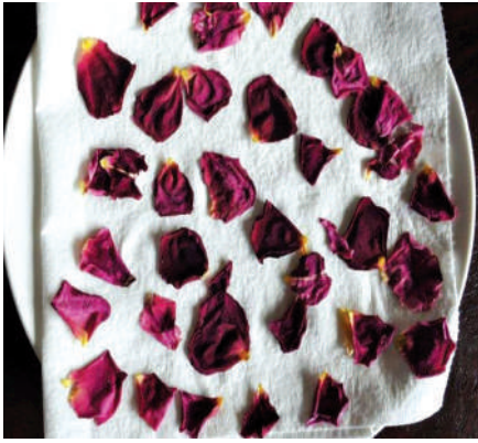
Rose petal lets after drying