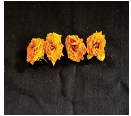
Hand-made floral cards using yellow dried bunny rose petals

beauty products embrace dried rose petals for its delicate and intense aroma in lieu of artificial fragrances. Natural oils made from dried or fresh petals are predominantly worthwhile for sensitive skin to moisturize and generate a soothing feeling. Besides, the application of a well mixed paste made up of pre-soaked and mashed 8 dried rose petals along with 3 tablespoons of honey followed by a thorough cold water rinse create a calming face mask. So in fine, anyone can discover how these lush dried or fresh blossoms can make ones skin feel as velvety soft as a bed of roses.