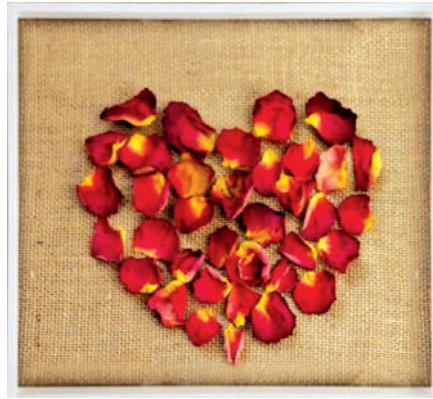
Hand-made floral craft using red dried rose petals