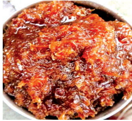
Sweet rose Gulkand