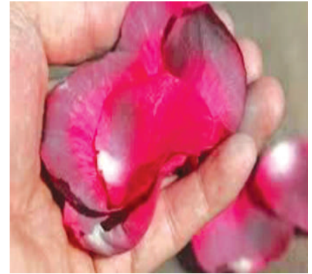
Freshly harvested rose petals before drying

of scented dried petals of Rosa x damascena and 3 cups of sugar. Infusion is another common way of cooking with rose petals. This might be a simple rose petal tea, a sugar-water infusion for a flavoured cocktail syrup, or a more complex infusion for custard, gelatine or opaline. Edible dried rose petals are delicious for desserts like almond sponges or semolina puddings collaterally their flavours can be also incorporated in some western dishes like Turkish delight cheesecake for inspiration. Rose petals occasionally appear in Indian dishes too like Hyderabadi Biryani where dash of rose water is added. They have immense entail for many savoury and meat dishes in Mexican and Mediterranean cooking. They are most usual ingredient in kulfi or sweetened rice dishes. In the context of British cooking, clean flavours like cucumber or apple pair well with rose petals. Red, light pink, dark pink, white, yellow, orange, mauve or blue petals also make a stunning contrast against the greens in a salad. Thus, besides their uses for their aromas, floral flavours, symbolism or decorativeness, they are a beautiful addition to the chef's arsenal.