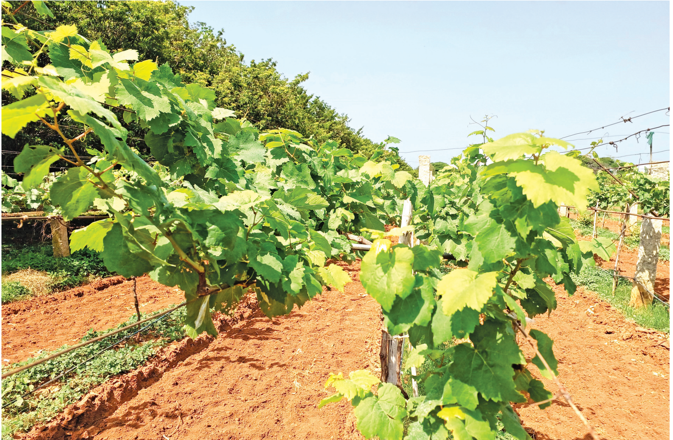
Healthy vineyard after forward pruning

and phosphorus (P), or Top KP+ combined with ready mixtures of micronutrients [zinc (Zn), boron (B), copper (Cu), iron (Fe), manganese (Mn) and molybdenum (Mo)] are highly effective in controlling powdery mildew on grapevines by inhibiting conidial germination causing mildew.