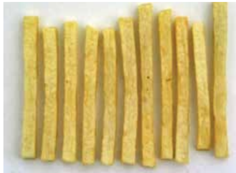
Potato French fries