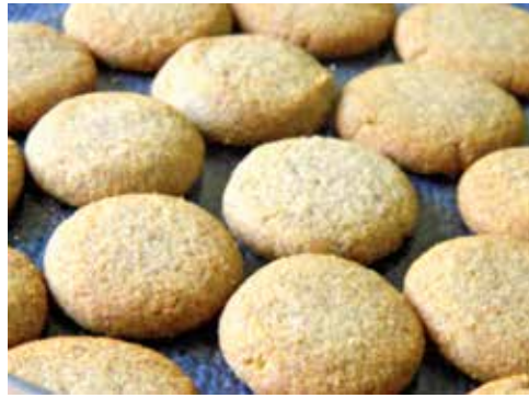
Gluten free potato cookies