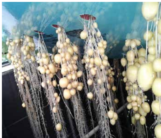
Potato mini-tubers grown using an aeroponics system technology

nutrient-rich solution on a regular basis to grow plants in a closed environment. When compared to cultivation under net-house conditions, this technology has the advantage of producing seven to ten times more mini-tubers from in vitro plantlets.