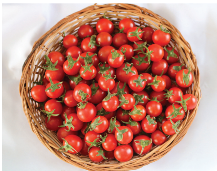
Fruits of tomato variety Pusa Red Cherry Tomato-3 at maturity