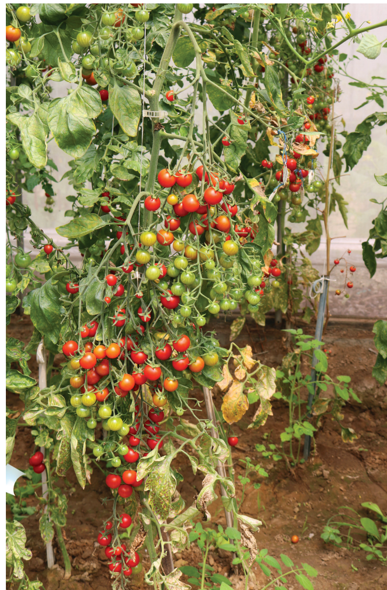
Plant of tomato variety Pusa Red Cherry Tomato-3 in fruiting stage

Staking should be initiated 20–25 days after transplanting. Plants are tied loosely to vertical stakes using soft ties. All lateral shoots are removed early to maintain a single or double stem system. Plants are supported with plastic twine or clips attached to overhead support wires placed 8–10 feet above ground level. Continuous pruning of side shoots throughout the crop duration improves fruit quality. After the first harvest, lower leaves up to one foot above the ground should be removed to enhance ventilation and reduce disease incidence.