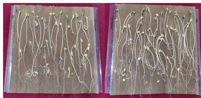
T 1 : Control T 3 : Standard nano Zn @ 750 ppm

Germination of seed is considered as one of the most significant step for determining the success or failure of crop establishment. In the present study, seed priming with standard nano zinc @ 750 ppm ( T_3 ) recorded significantly highest seed germination (84.5%) (Table 1 and Plate 1), longest shoot (23.9 cm) and root (20.7 cm) length compared to all other treatments. This was followed by green synthesized silver nanoparticles @ 250 ppm ( T_6 - 79.5%, 19.5 cm & 19.1 cm). Whereas the lowest seed germination, shoot and root length was observed for control ( T_1 - 73.5%, 17.9 cm & 16.5 cm).