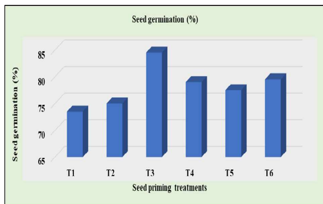
Legend: T 1 : Control T 2 : Hydro priming T 3 : Standard nano zinc @ 750 ppm, T 4 : Green synthesized nano zinc @ 500 ppm T 5 : Standard nano silver @ 500 ppm, T 6 : Green synthesized nano silver @ 250 ppm