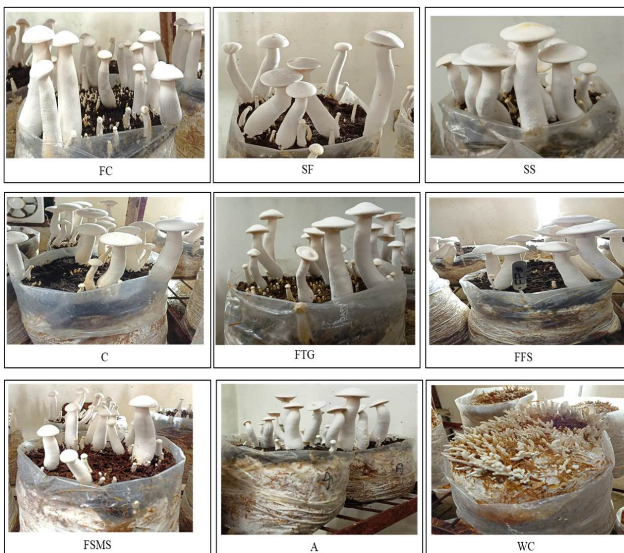
Fig. 1. Evaluation of the Calocybe indica on the different casing material. FC: FYM +coirpith (80:20); SF : Spent Mushroom Substrate of button mushroom (SMS)+FYM (50:50) ; SS: Garden soil +Sand (75:25); C: Coir pith; FTG :Formalin treated-Garden soil+sand (75:25);FFS: Formalin treated-FYM+ sand (75:25); FSMS: Formalin treated-SMS; A: Autoclaved Garden soil + Sand (75:25); WC: without casing

Casing is general agronomic practice for the commercial cultivation of the C. indica . It helps in