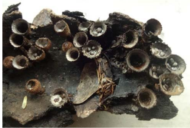
Fig. 1. Macroscopic image of Cyathus subglobisporus showing the plicate peridium and dark brown tomentose surface

Cyathus subglobisporus sp. nov. was identified based on distinct morphological traits that differentiate it from closely related species of the Cyathus genus. The fruiting bodies of this species are gregarious, measuring 3–5 cm in height, with a dark brown, tomentose outer surface. The peridium is cup-shaped with plicate ridges, which become more pronounced as the fruiting body matures. The inner surface of the peridium is smooth and glossy, contrasting with the tomentose exterior (Fig 1).