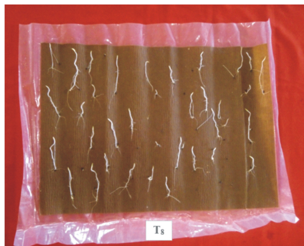
Seed germination (%) in nitric acid treatment