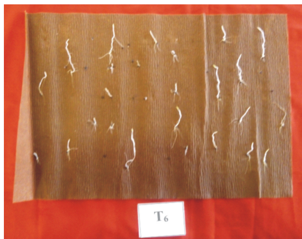
Seed germination (%) in beejamrutha treatment