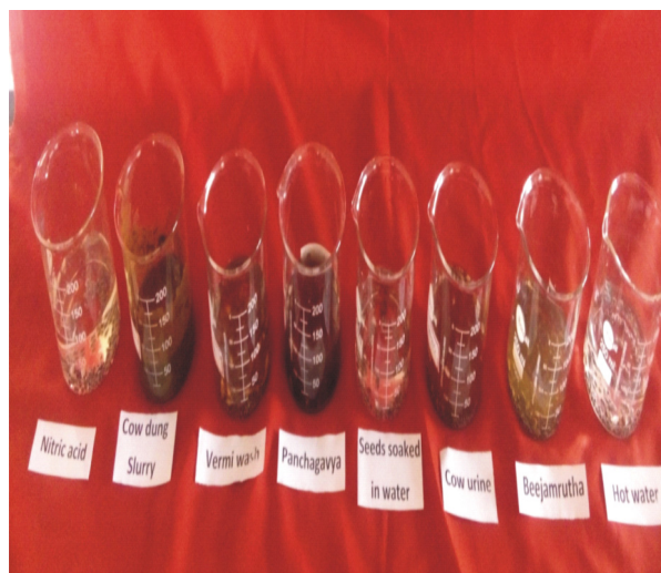
Pre-treatment of cardamom seeds with different organics