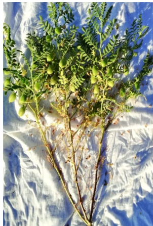
Semi erect- JCP - 140