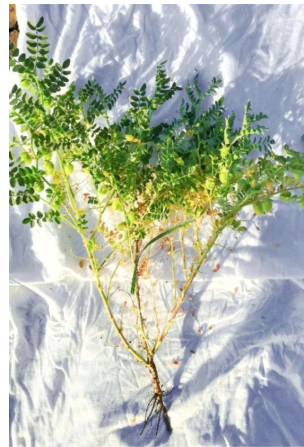
Spreading – ICC 9239