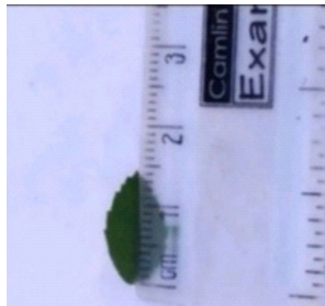
Medium – GCP 9709