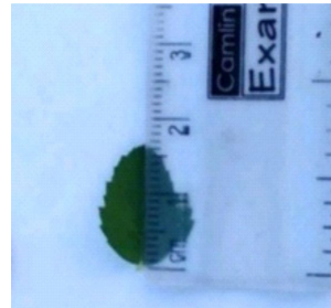
Large – JCP 140