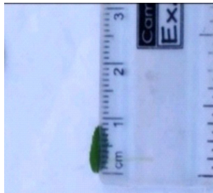
Small – JCP 63