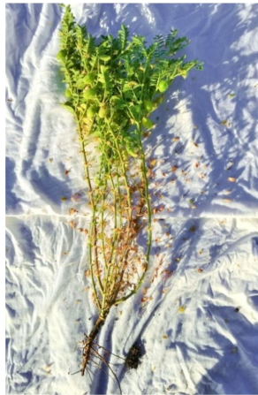
Erect – GJG 0906