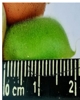
Medium – JCP 54