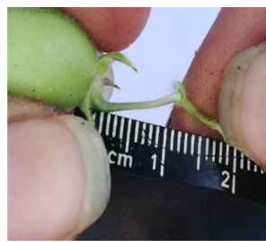
Long – JCP 17