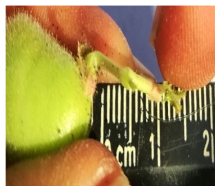
Medium – JCP 63