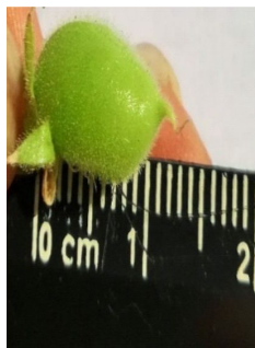
Small – ICC 5147