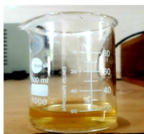
Dark yellow -BG 39