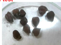
Black: ICCV 05529 Modified phenol test B (Na 2 CO 3 )