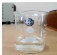
No Colour -GJG 3