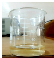
Light Yellow- GJG 3