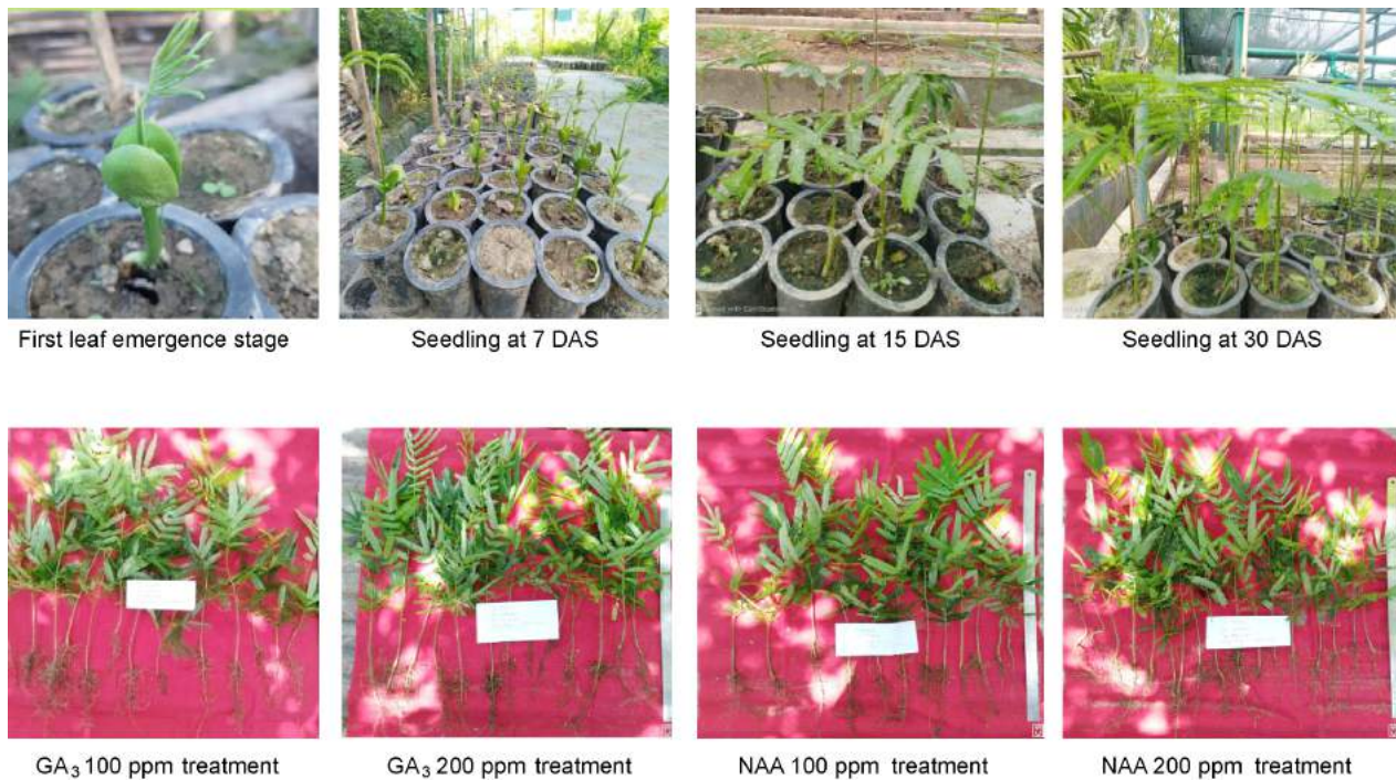
Figure 3. Influence of pre-sowing treatments on a) Seed Germination and b) Initial growth attributes

seedling vigour than other treatments. Prolonged exposures to conc. acids such as HCl and H 2 SO 4 damages the embryo thus not recommended for pre-sowing seed treatment. In particular our study recommends the use of organic treatments i.e. water soaking for 24 hour and Cow dung slurry (1:1) for 12 hour, pre-treatments as they are not only cheap and easy to use and also fulfills all the pre requisites needed for seed germination and growth attributes in seedlings of P. timoriana .