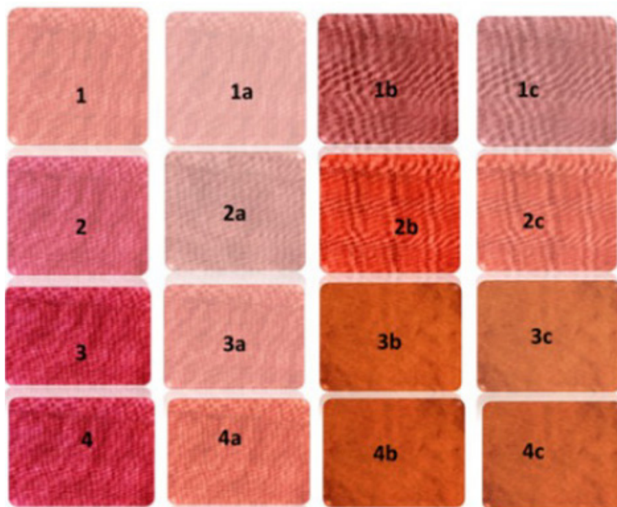
Fig. 3. Colour Shades Obtained from Manjistha Dyeing with Different Mordants

Reuse of the dye bath results in a decrease in color strength compared to the first dyeing but remains substantially higher than the values without mordant, demonstrating the